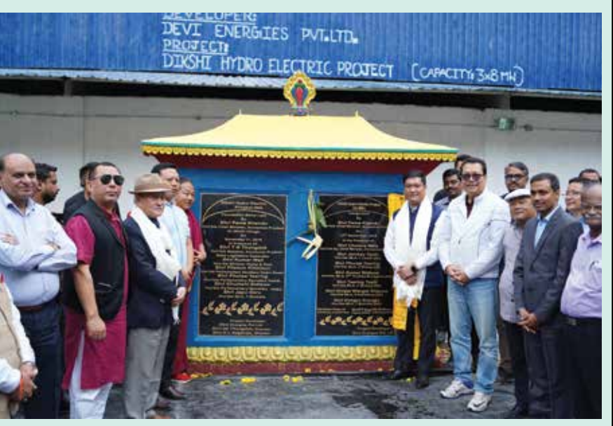
Inauguration of the project by Sri Pema Khandu, Hon'ble Chief Minister of Arunachal Pradesh